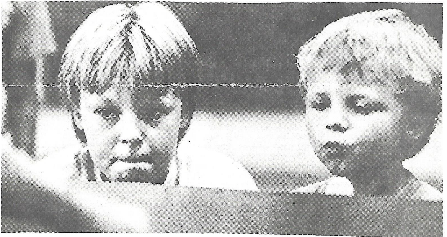
The Jackson Optimist Sports Arena was packed with competitors for the National Slot Car Racing Championships.